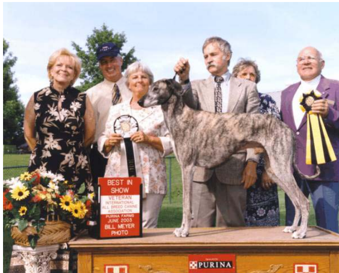
First FCI International Ch. Aswad Shi'Rayân, ORC, SGRC, FCC, TT 2 BISS, 6 BIS,32 BOG, and 4 BIS Veteran, 10 1/2 years old ©Meyer