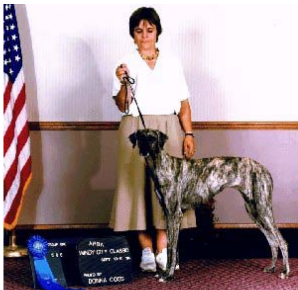
FCI,Ch. WW97A'Ssisa Shi'Rayân, SGRC, ORC, FCC First Beauty champion and first Best of Group winner in the USA

The Sloughis owned or bred by Shi'Rayan, participated actively in dog shows and won top awards, following the effort of previous owners of Sloughis, in an effort to familiarize American and Canadian judges to the breed.