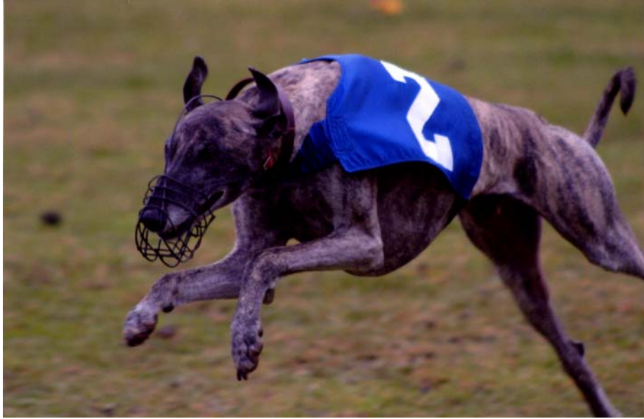
Ch. Fahel Shi'Rayân, SORC, SGRC6, FCC, F.Ch; #1 Sighthound in American Sprint Racing 2001 & 2002 # 1 Sighthound all years combined in American Sprint Racing