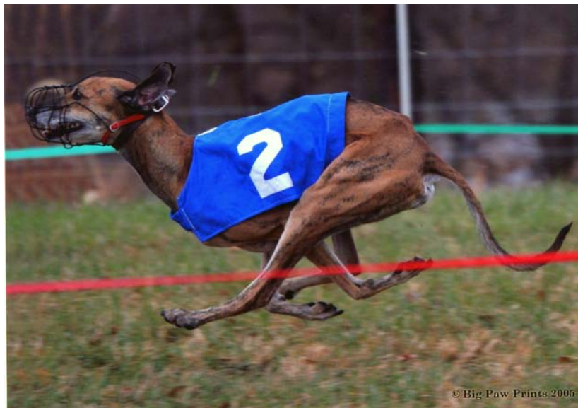
Ch. l'Saar Shi'Rayân, ORC, SGRC4, #1 Sighthound in American Sprint Racing 2006

Since the 1970s, other Sloughis have been imported. They came from France (Kahloul de la Treille, de la Cité du Guerrier, de la Horde d'Or, Min Ahrar al Magrib), Holland (Mumtaz-i-Javanadmi), Germany (Schuru-esch-Schams, el Tahiri, Sheik el Arab, Mahanajim), Sweden (Syringa), Tunisia (Rym Cassandra, Tarfa) and from Algeria (Richa & Ramla). Through these dogs other lines were represented such as French Ben Bahram, Dutch Min Darazja Loewwla and El Cid, Swiss el Djerid, Moroccan G'zel Ouled Laouichat, and Libyan Dukal umm bersheba el Abid. Thus most European, as well as country of origin, bloodlines are represented in the American Sloughi today.