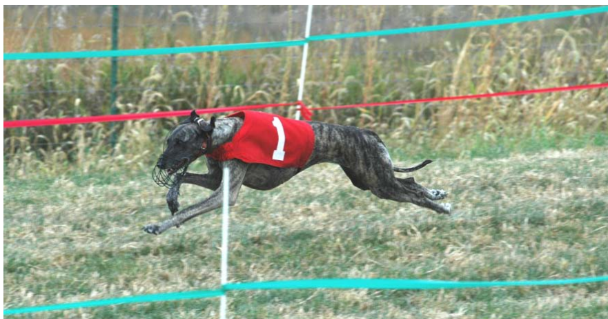
Ch. Syringa Happiness at Shi'Rayân, SGRC, ORC

First European import sprint racing champion Sloughi male: Bi-Na Mahanajim