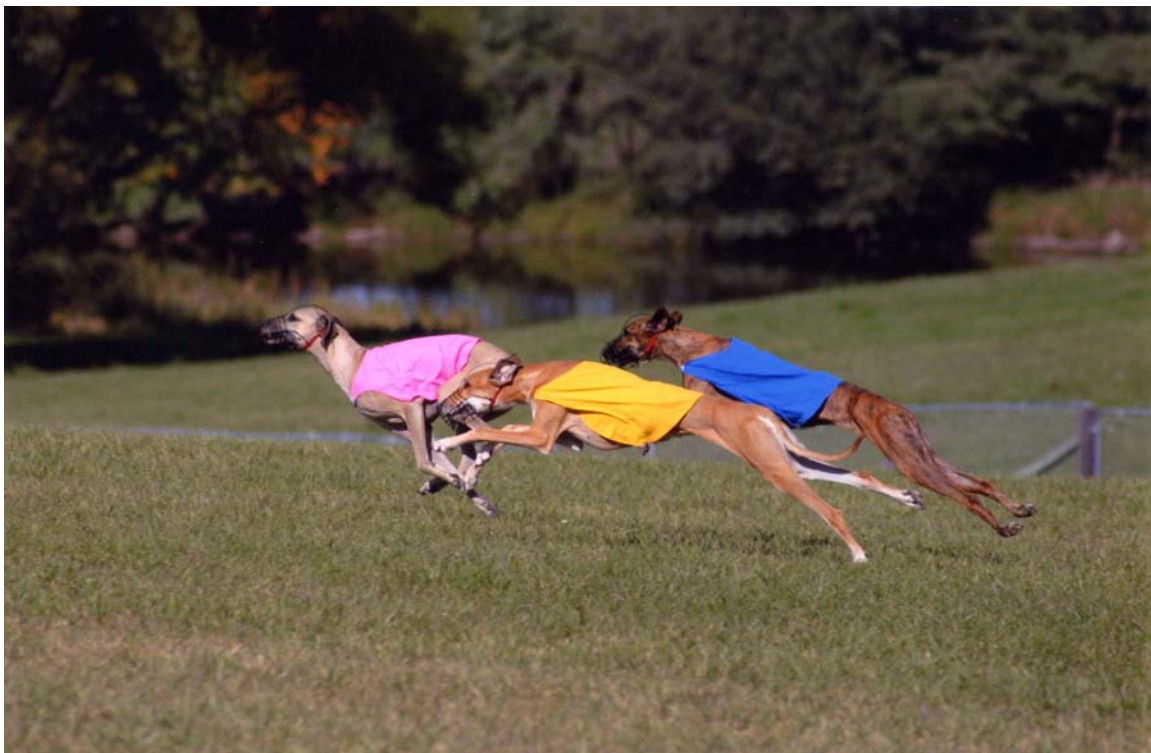
Ch.Hayifa, SGRC, ORC, F.Ch, Ch.Ibtsama Haifa Shi'Rayan, GRC, F.Ch. and Ch.Laza Shi'Rayân, GRC

In 2004 the American Kennel Club allows the breed Sloughi to participate in its coursing tests as demonstration and Sloughis start to participate to acquire the Junior Courser title (the only AKC title available for Sloughis at this time). Starting October 1 2006 the breed is able to compete in coursing AKC events.