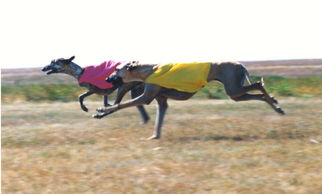
Ch Bouthayna Shi'Rayân, SORC, GRC, FCM and Ch Balsam Shi'Rayân, ORC, GRC, FCC California