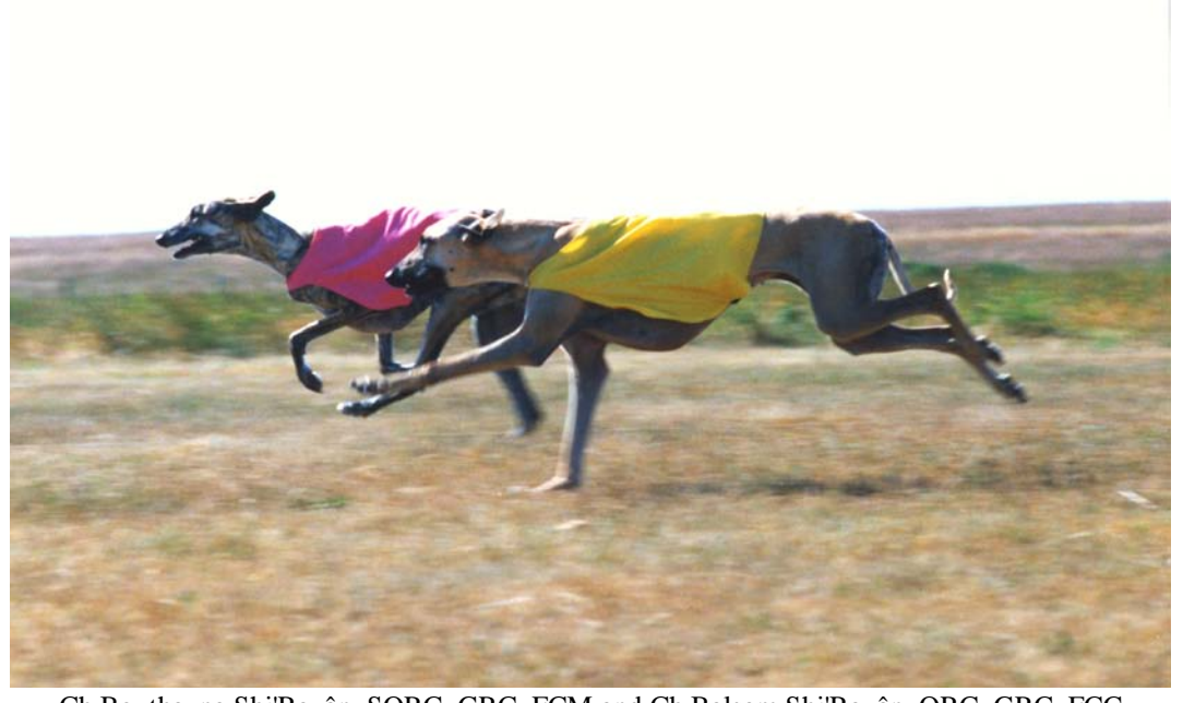
Ch Bouthayna Shi'Rayân, SORC, GRC, FCM and Ch Balsam Shi'Rayân, ORC, GRC, FCC California