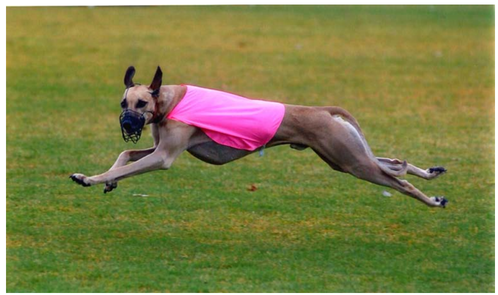
Bahlawaan Sheik el Arab, GRC, F.Ch.

First Junior Coursers Shi'Rayan Nayyir at Mazoe and Najeeb Storm Shi'Rayan