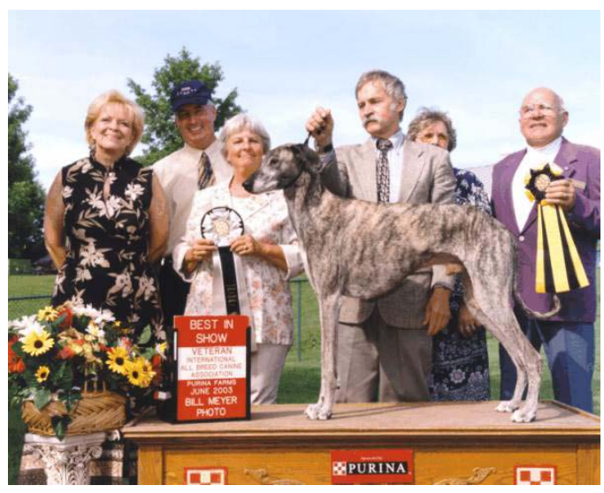
First FCI International Ch. Aswad Shi'Rayân, ORC, SGRC, FCC, TT 2 BISS, 6 BIS,32 BOG, and 4 BIS Veteran, 10 1/2 years old