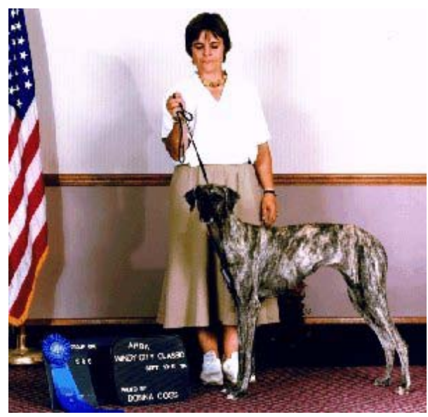
FCI,Ch. WW97A'Ssissa Shi'Rayân, SGRC, ORC, FCC First Beauty champion and first Best of Group winner in the USA

The Sloughis owned or bred by Shi'Rayan, participated actively in dog shows and won top awards, following the effort of previous owners of Sloughis, in an effort to familiarize American and Canadian judges to the breed.