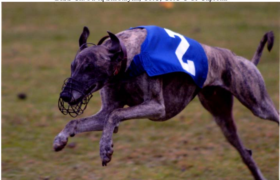
Ch. Fahel Shi'Rayân, SORC, SGRC6, FCC, F.Ch; #1 Sighthound in American Sprint Racing 2001 & 2002 # 1 Sighthound all years combined in American Sprint Racing

BISS Ch. Fa'iq Shi'Rayân, ORC, GRC © de Caprona