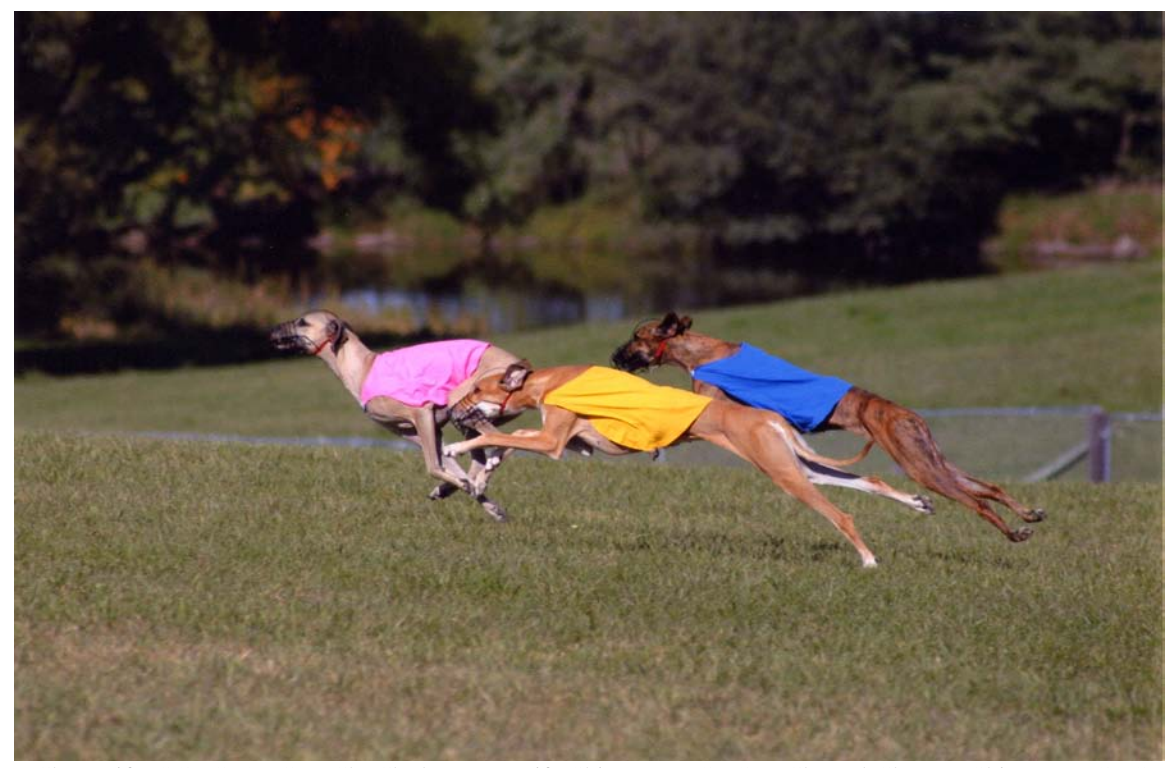
Ch.Hayifa, SGRC, ORC, F.Ch, Ch.Ibtsama Haifa Shi'Rayan, GRC, F.Ch. and Ch.Laza Shi'Rayân, GRC

In 2004 the American Kennel Club allows the breed Sloughi to participate in its coursing tests as demonstration and Sloughis start to participate to acquire the Junior Courser title (the only AKC title available for Sloughis at this time). Starting October 1 2006 the breed is able to compete in coursing AKC events.