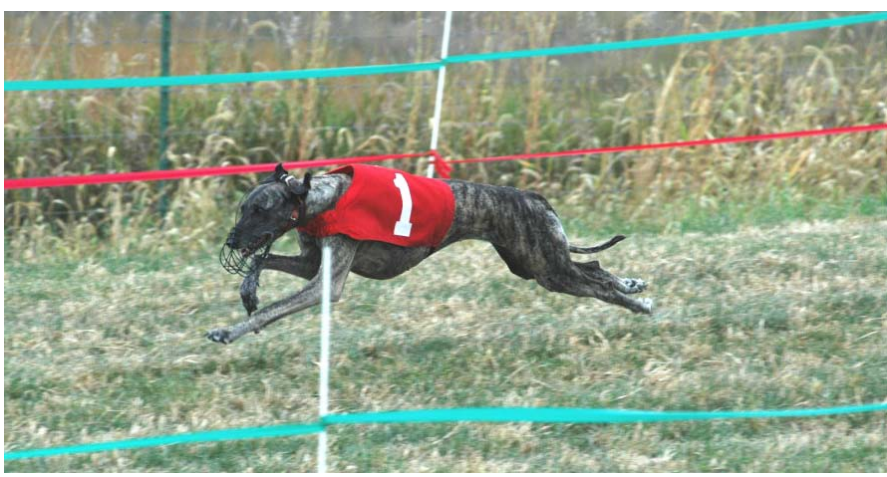
Ch. Syringa Happiness at Shi'Rayân, SGRC, ORC

First European import sprint racing champion Sloughi male: Bi-Na Mahanajim