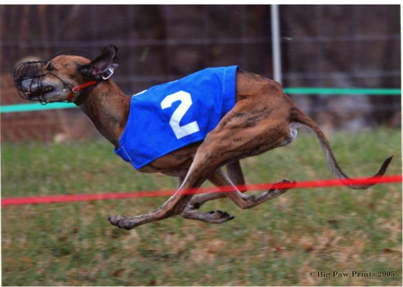
Ch. I'Saar Shi'Rayân, ORC, SGRC4, #1 Sighthound in American Sprint Racing 2006

Since the 1970s, other Sloughis have been imported. They came from France (Kahloul de la Treille, de la Cité du Guerrier, de la Horde d'Or, Min Ahrar al Magrib), Holland (Mumtaz-i-Javanadmi), Germany (Schuru-esch-Schams, el Tahiri, Sheik el Arab, Mahanajim), Sweden (Syringa), Tunisia (Rym Cassandra, Tarfa) and from Algeria (Richa & Ramla). Through these dogs other lines were represented such as French Ben Bahram, Dutch Min Darazja Loewwla and El Cid, Swiss el Djerid, Moroccan G'zel Ouled Laouichat, and Libyan Dukal umm bersheba el Abid. Thus most European, as well as country of origin, bloodlines are represented in the American Sloughi today.