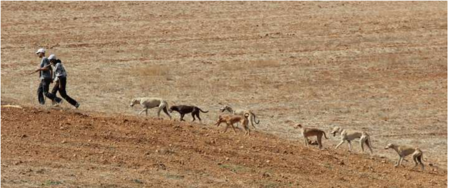
Four Sloughis with their masters, a tracking Braque and two tracking Rateros in Algeria, North Africa (Rateros are a Podenco type, Braque a Pointer type)