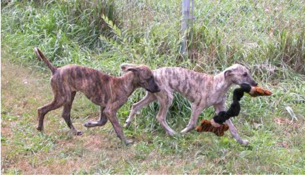
Sloughi Puppies are, from early on, sound movers.

The Sloughi's head appears at first as relatively wide, particularly in males. This good width of skull is coupled with similar lengths of skull and muzzle, with a slight stop. Seen from the side, the head is longish, refined, delicate but rather strong. Seen from above, it has the shape of a long wedge, the skull being the widest part, tapering to the tip of the nose. Between the ears, the skull measures about 4-6 inches (12-14 cm). The skull is distinctly rounded at the back and curving harmoniously on the sides. The nose is black with thin and supple lips just covering the lower jaw and the corner of the mouth is to be barely noticeable. The Sloughi's scissor bite shows normal teeth set on strong jaws. The AKC standard adds a level bite. Strong dewlaps and flews are to be avoided.