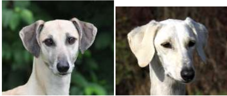
Differences in head features and ear size and shape between Sloughi (left) and smooth Saluki (right)