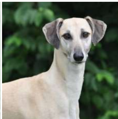
Bensekrane's Saff © de Caprona and V'Hadiyyah Shi'Rayan © Markus Arndt Left: Correct planes of skull and bridge of muzzle in relationship to each other Right: Proportions of the Sloughi head seen from the front