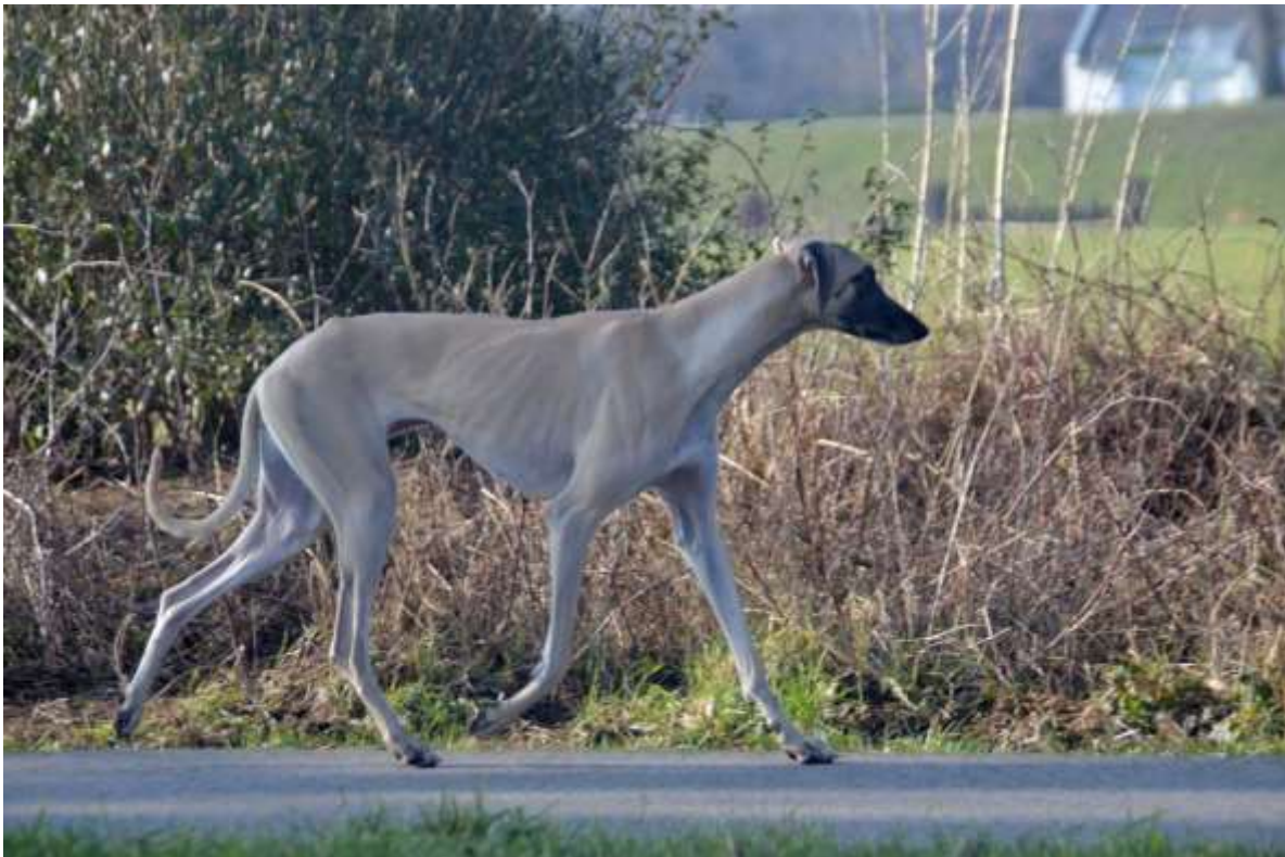
Correct natural gait of the Sloughi, multi Ch. Malala Schuru-esch-Schams, FCI EuroSighthound 2016

On the move, the Sloughi appears effortless, feather light and covers ground without excessive reach and drive. His back stays level while he trots. The tail, with its typical upward curve, is to be carried no higher than the back, although the AKC standard accepts the upward curve reaching above the line of the back when the animal is excited. Puppies and Juniors are fleet of foot too.