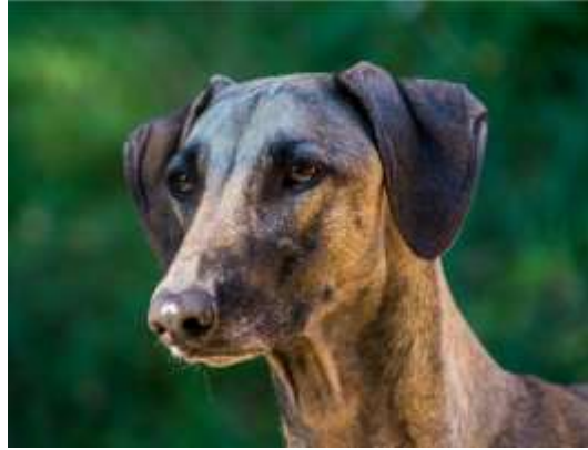
Left: Phareeda Shi'Rayan