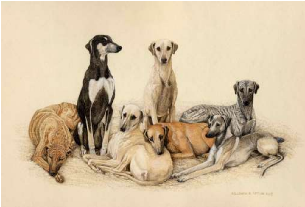
Some of the Sloughi's coat colors. "The Nap" Tempera by the author.

From left to right: red brindle/black mask, sand/black mantle, sand/black mask, sand, red sand/black mask, sand/brindle/black mask, sand/dark overlay/black mask