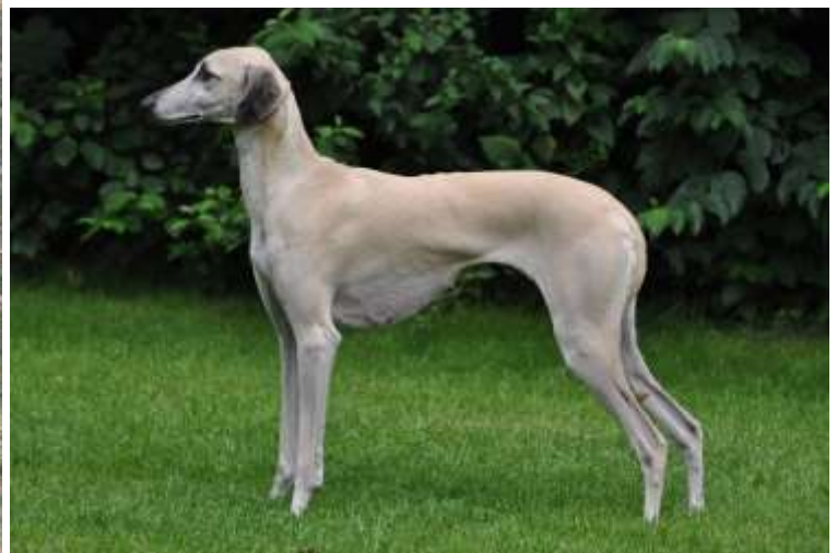
Classic moderate Sloughis of recent African lineage (Tunisian, Algerian and Moroccan) with correct silhouettes

Bitches are allowed a little additional length of body, as with other breeds too Left © de Caprona, right © Marcus Arndt (Germany)