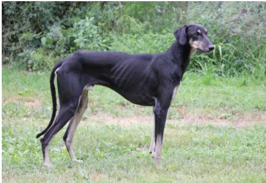
Male Sloughi showing the correct lean muscles of the breed as well as a rare combination of most of the black markings of the breed: black mantle, brindle, black mask

From left to right: red brindle/black mask, sand/black mantle, sand/black mask, sand, red sand/black mask, sand/brindle/black mask, sand/dark overlay/black mask