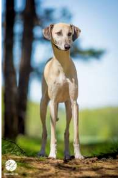
Classic moderate Sloughia of recent African lineage (Algerian and Moroccan) Correct head, front and rear.

Seen from the front, the Sloughi should not appear barrel chested, the ribs are relatively flat and the last floating ribs slightly rounded. The chest is neither too wide nor too narrow.