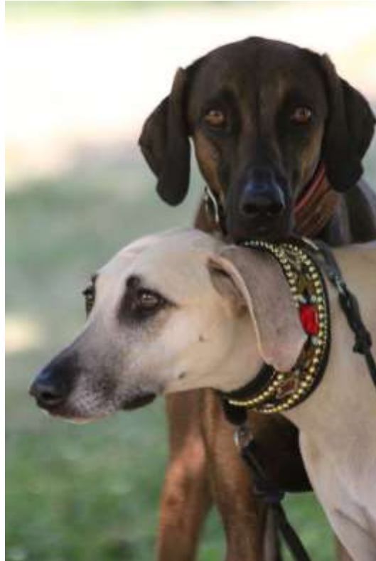
Variations of fawn, from mahogany red fawn to light sand Elegantin Magma and V'Hibba Shi'Rayan

On the move, the Sloughi appears effortless, feather light and covers ground without excessive reach and drive. His back stays level while he trots. The tail, with its typical upward curve, is to be carried no higher than the back, although the AKC standard accepts the upward curve reaching above the line of the back when the animal is excited. Puppies and Juniors are fleet of foot too.