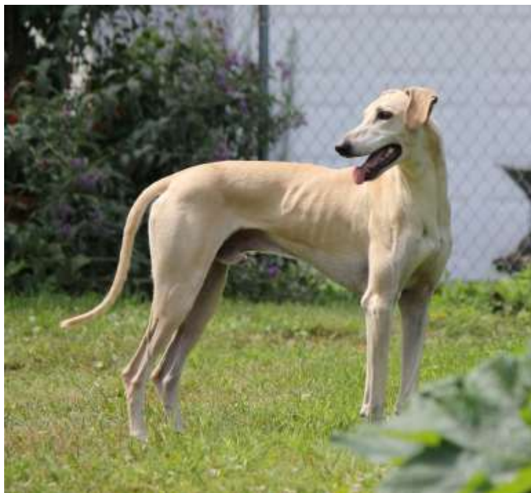
Bensekrane's Saff, country of origin Algerian Sloughi

An edited version of this article was first published in the Winter Issue 2017 of Sighthound Review