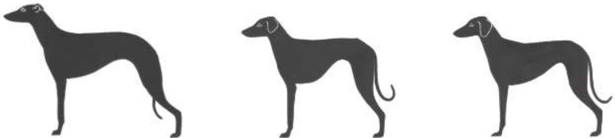
From left to right, silhouettes of Greyhound, Sloughi and Smooth Saluki These drawings by the author show the differences between the breeds, not ideals for each breed.

The Sloughi's head, particularly in males, appears stronger and less chiseled than that of the Saluki. The Sloughi's ears are usually shorter than Saluki ears and should not reach below the lower jaw.