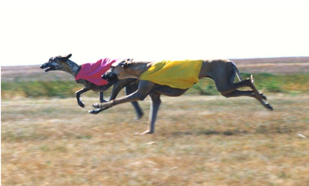
Ch Bouthayna Shi'Rayân, SORC, GRC, FCM and Ch Balsam Shi'Rayân, ORC, GRC, FCC California