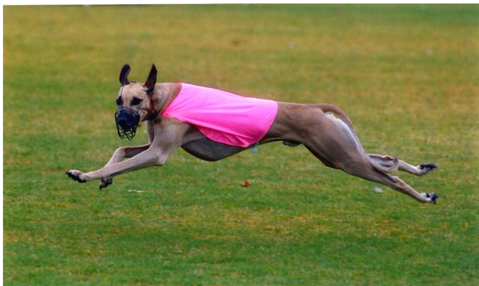
Bahlawaan Sheik el Arab, GRC, F.Ch.