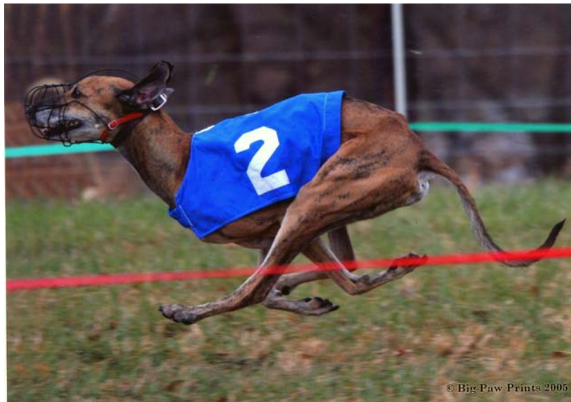
Ch. I'Saar Shi'Rayân, ORC, SGRC4, #1 Sighthound in American Sprint Racing 2006

Since the 1970s, other Sloughis have been imported. They came from France (Kahloul de la Treille, de la Cité du Guerrier, de la Horde d'Or, Min Ahrar al Magrib), Holland (Mumtaz-i-Javanadmi), Germany (Schuru-esch-Schams, el Tahiri, Sheik el Arab, Mahanajim), Sweden (Syringa), Tunisia (Rym Cassandra, Tarfa) and from Algeria (Richa & Ramla). Through these dogs other lines were represented such as French Ben Bahram, Dutch Min Darazja Loewwla and El Cid, Swiss el Djerid, Moroccan G'zel Ouled Laouichat, and Libyan Dukal umm bersheba el Abid. Thus most European, as well as country of origin, bloodlines are represented in the American Sloughi today.