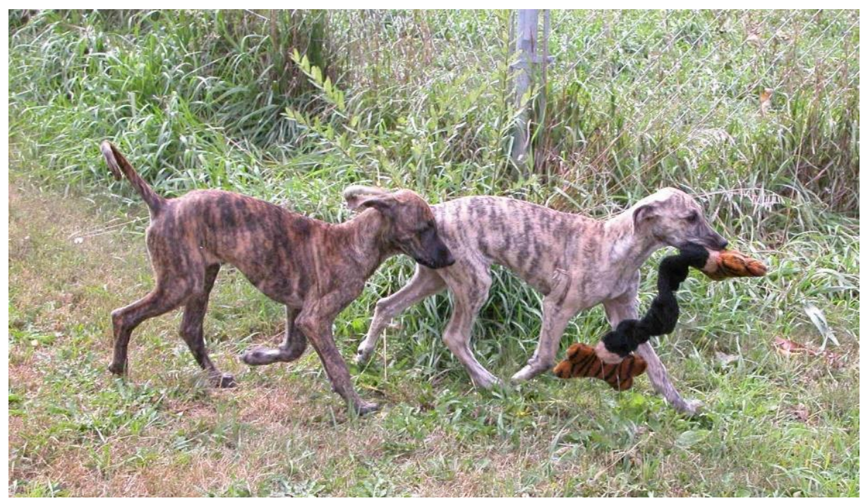
Sloughi Puppies are, from early on, sound movers.

The Sloughi's head appears at first as relatively wide, particularly in males. This good width of skull is coupled with similar lengths of skull and muzzle, with a slight stop. Seen from the side, the head is longish, refined, delicate but rather strong. Seen from above, it has the shape of a long wedge, the skull being the widest part, tapering to the tip of the nose. Between the ears, the skull measures about 4-6 inches (12-14 cm). The skull is distinctly rounded at the back and curving harmoniously on the sides. The nose is black with thin and supple lips just covering the lower jaw and the corner of the mouth is to be barely noticeable. The Sloughi's scissor bite shows normal teeth set on strong jaws. The AKC standard adds a level bite. Strong dewlaps and flews are to be avoided.