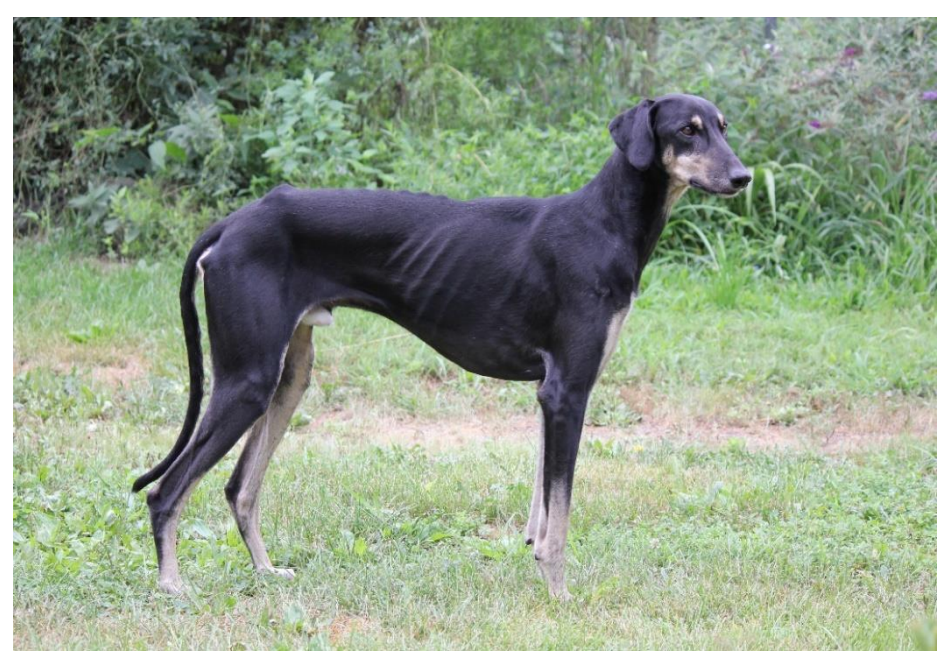
Male Sloughi showing the correct lean muscles of the breed as well as a rare combination of most of the black markings of the breed: black mantle, brindle, black mask