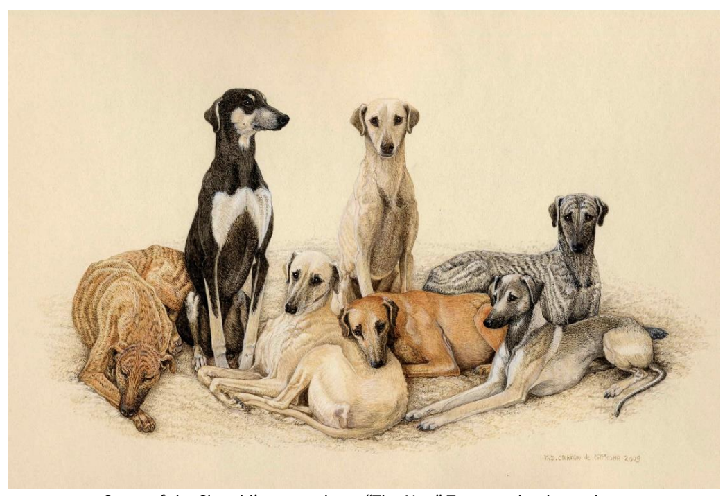
Some of the Sloughi's coat colors. "The Nap" Tempera by the author. From left to right: red brindle/black mask, sand/black mask, sand/black mask, sand/black mask, sand/black mask, sand/black mask, sand/black mask

white markings on tip of toes or on chest are usually tolerated, the ideal coat color being solid with no white markings.