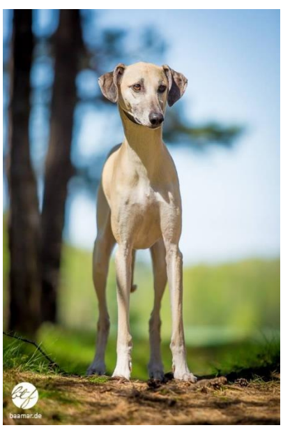
Classic moderate Sloughia of recent African lineage (Algerian and Moroccan) Correct head, front and rear.

Seen from the front, the Sloughi should not appear barrel chested, the ribs are relatively flat and the last floating ribs slightly rounded. The chest is neither too wide nor too narrow.