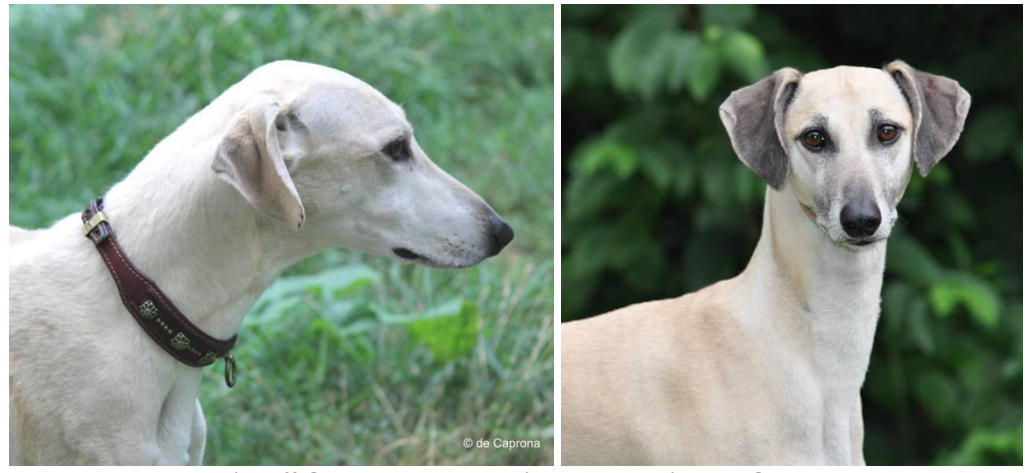
Bensekrane's Saff © de Caprona and V'Hadiyyah Shi'Rayan © Markus Arndt Left: Correct planes of skull and bridge of muzzle in relationship to each other Right: Proportions of the Sloughi head seen from the front

The expression of the large brown eyes is alert, gentle and slightly melancholy. Their color are shades of amber in light coats to dark brown, eye rims being pigmented.