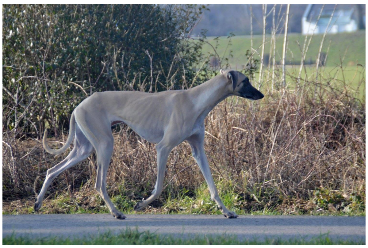
Correct natural gait of the Sloughi, multi Ch. Malala Schuru-esch-Schams, FCI Eurosighthound 2016

On the move, the Sloughi appears effortless, feather light and covers ground without excessive reach and drive. His back stays level while he trots. The tail, with its typical upward curve, is to be carried no higher than the back, although the AKC standard accepts the upward curve reaching above the line of the back when the animal is excited. Puppies and Juniors are fleet of foot too.