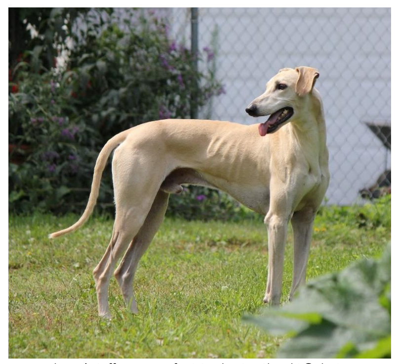
Bensekrane's Saff, country of origin Algerian Sloughi

An edited version of this article was first published in the Winter Issue 2017 of Sighthound Review Nominated in 2017 for excellence by the Dog Writers Association of America