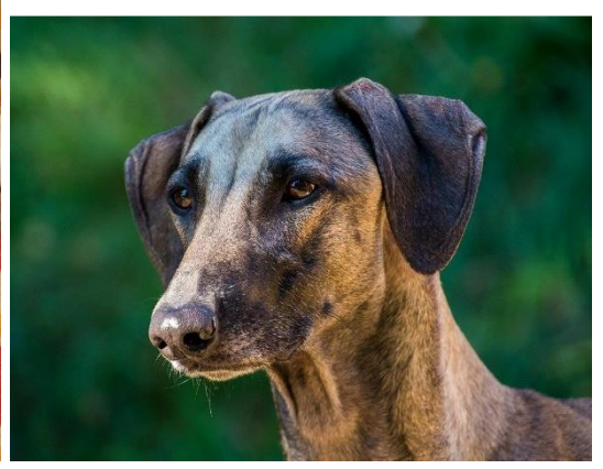
Left: Phareeda Shi'Rayan Right: head seen from ¾, Qalb Elassad Ayda

The characteristics of the Sloughi that make it such an attractive breed are also further highlighted indirectly by what are considered faults or disqualifications in the breed. Although the AKC standard makes no mention of them, the FCI standard lists faults as any departure from the foregoing points stated in the standard the seriousness with which the fault should be regarded to be proportionate to its degree. They are listed as follows: Bad ratio between length of body and height at withers, head and body slightly too heavy, stop too pronounced or not enough, eyes too light, top line not horizontal, croup narrow, too or insufficiently oblique, belly not enough tucked up, rounded ribs, chest not long enough, seen from the side cut up or very arched, tail too short, with too much hair, badly carried, muscles roundish and protruding, hair hard and coarse, small white mark on chest.