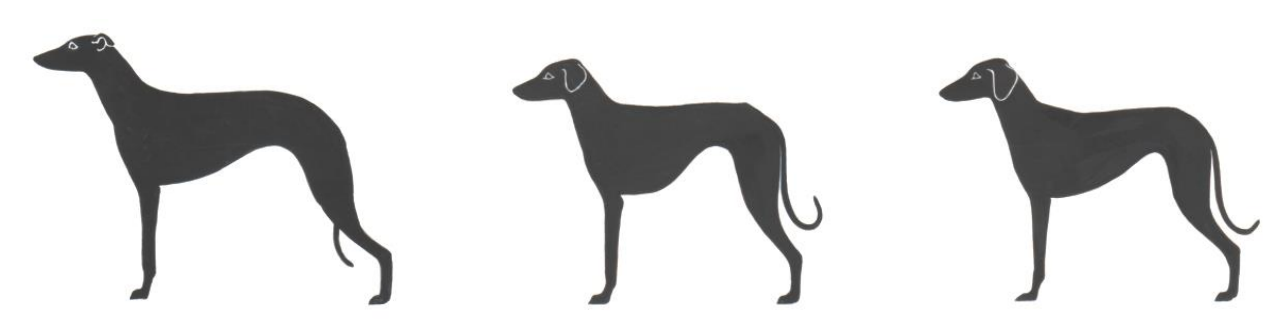
From left to right, silhouettes of Greyhound, Sloughi and Smooth Saluki These drawings by the author show the differences between the breeds, not ideals for each breed.

The Sloughi's head, particularly in males, appears stronger and less chiseled than that of the Saluki. The Sloughi's ears are usually shorter than Saluki ears and should not reach below the lower jaw.