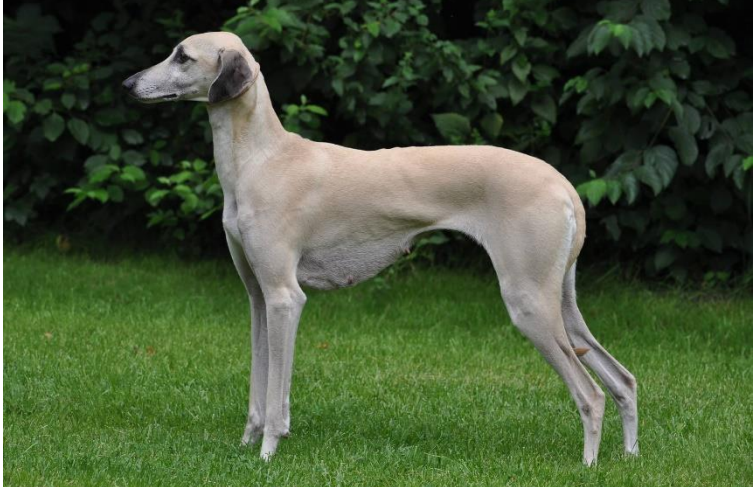
Classic moderate Sloughis of recent African lineage (Tunisian, Algerian and Moroccan) with correct silhouettes Bitches are allowed a little additional length of body, as with other breeds too Left © de Caprona, right © Marcus Arndt (Germany)

The Sloughi's coat is always short, its skin very fine, close fitting to the body, without folds. There is a large variety of coat colors in the breed. To use the breed's terminology, solid coats in all shades of dark mahogany fawn to light sand, with or without black markings such as dark overlay, black mantle, black ears, brindle, black mask are accepted. Although these coat colors exist in the country-of-origin Sloughis, liver mantle, liver brindle, liver mask, blue mantle, blue brindle, blue mask, white and black are not part of the current FCI standard and not cited in the AKC standard. Parti-colors were never part of any standard. Small