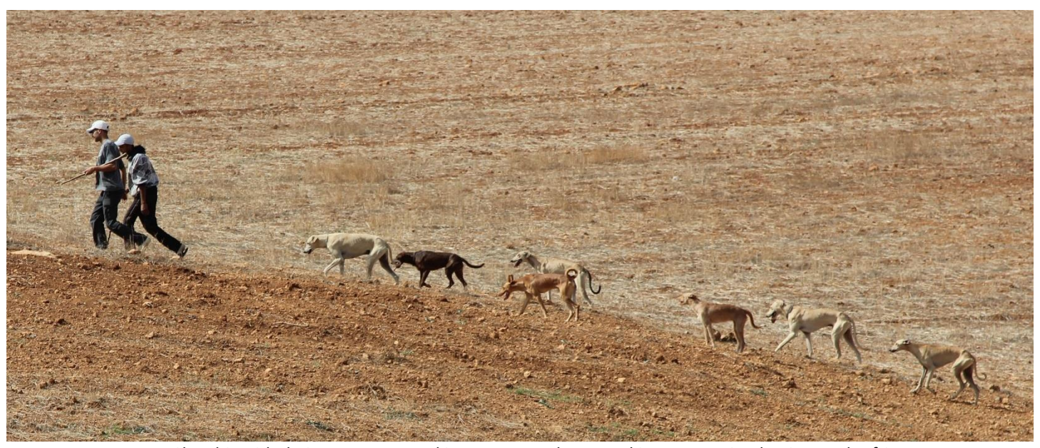
Four Sloughis with their masters, a tracking Braque and two tracking Rateros in Algeria, North Africa (Rateros are a Podenco type, Braque a Pointer type)