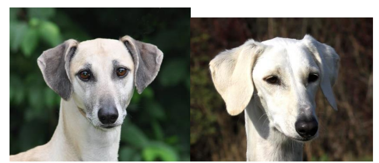
Differences in head features and ear size and shape between Sloughi (left) and smooth Saluki (right)