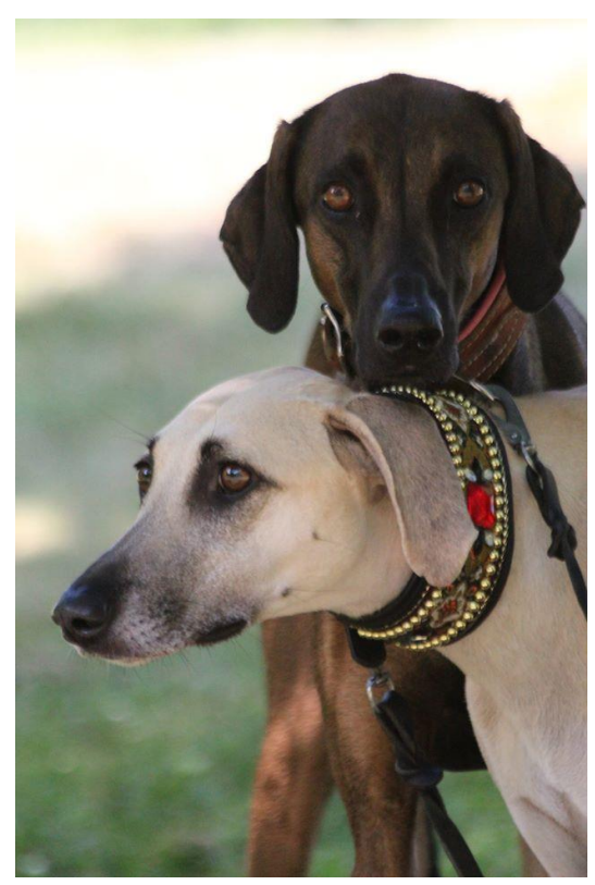
Variations of fawn, from mahogany red fawn to light sand © Chaouki (Finland) Elegantin Magma and V'Hibba Shi'Rayan

On the move, the Sloughi appears effortless, feather light and covers ground without excessive reach and drive. His back stays level while he trots. The tail, with its typical upward curve, is to be carried no higher than the back, although the AKC standard accepts the upward curve reaching above the line of the back when the animal is excited. Puppies and Juniors are fleet of foot too.